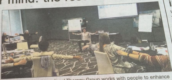
CHAIR TAI CHI – Diversional Therapy Group works with people to enhance their wellbeing.

WELLBEING is not only about good nutrition and exercise. Where seniors are concerned, especially those with limited mobility, there needs to be a good deal of thought and planning behind stimulating and enriching their lifestyle. The Diversional Therapy Group, based in Melbourne, has a dedicated team of diversional therapists who work with people of all abilities to create specialised leisure and health activities. Programs include chair tai chi, chair dance, guided meditation and cognitive activities. The group will travel to seniors in their home, whether it is a private residence, retirement village or aged care facility. Group sessions are designed to help improve quality of life and